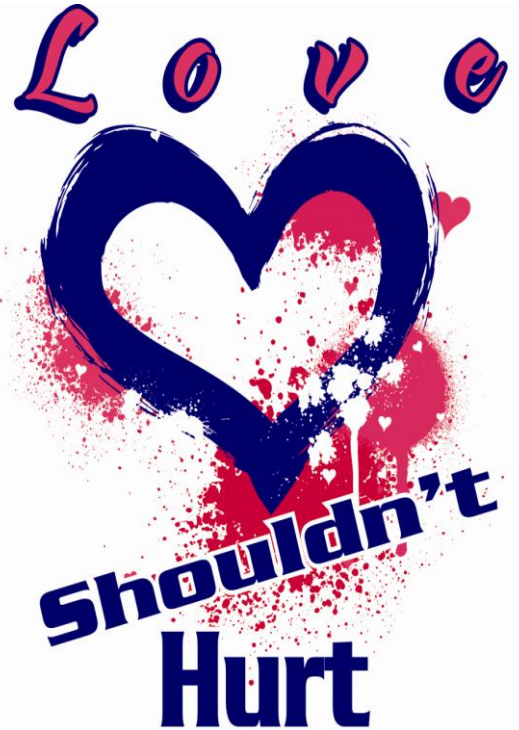
The new T-shirt design located at the Purple Ribbon Thrift Store

Please support and promote the Family Guidance Center by shopping at The Purple Ribbon Thrift Store. Any questions call (828) 322-3423