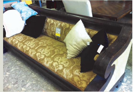
An antique sofa from 1864 just in at the Purple Ribbon!

The Purple Ribbon Thrift Store has beautiful and comfortable furniture just in! The prices are great! More pictures and info on the Facebook at The Purple Ribbon Thrift Store or call for more information 828-322-3423