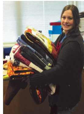
First Step employee getting quilts ready to be given to the Shelter For Battered Women

Thanks to the Catawba Valley Quilters Guild, women and children, fleeing from abuse, will be using beautiful donated quilts for warmth, security, and love!