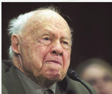
Just recently, actor Mickey Rooney told the world that he is a victim of elder abuse.

Domestic violence occurs in elderly relationships. It's one type of elder abuse, which we'll explore in next month's newsletter. Watch for it. Our newsletter focus today is on elder abuse in general.