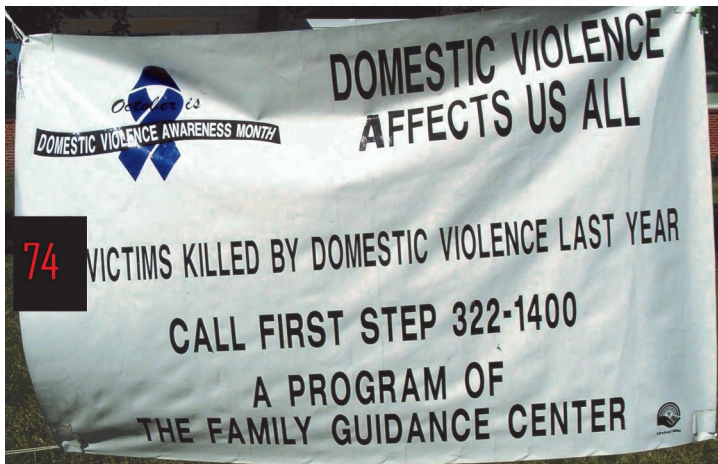
Sign outside of the Family Guidance Center, acknowledging October as Domestic Violence Awareness Month

Presentations will be provided to faith groups throughout the month